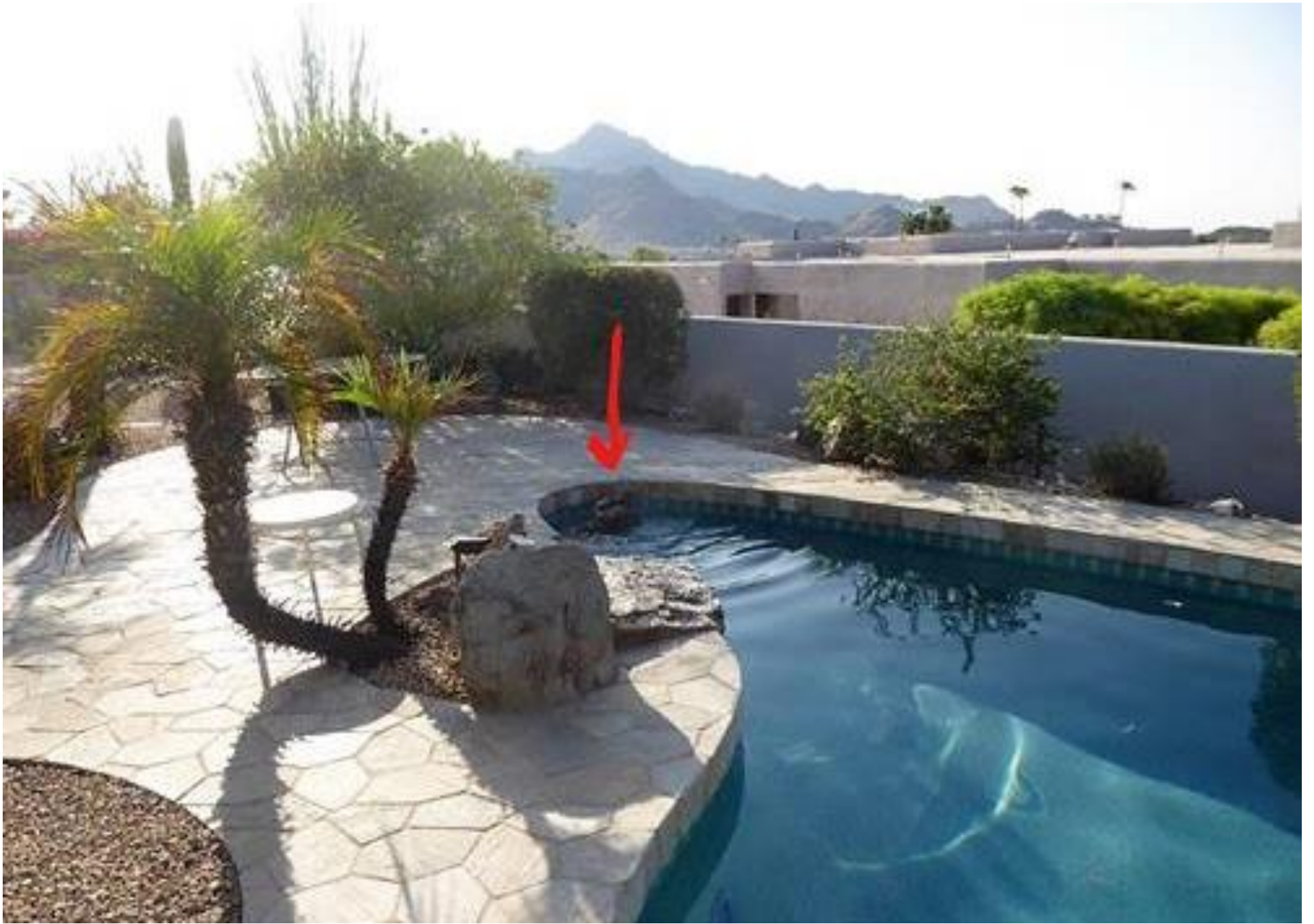
Perhaps a pina colada with a bit of a mouse garnish?? (!)