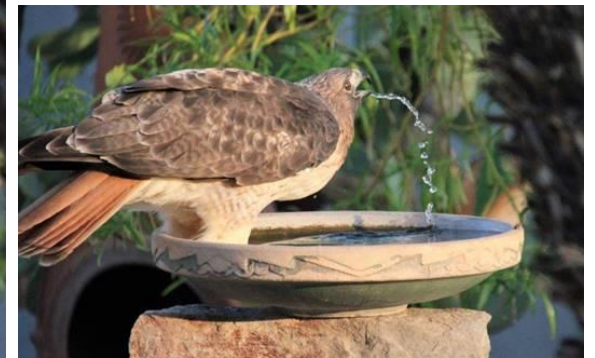
Ahhh - Better than a Bud! That Old Beak is Good for eating, not so good for scooping (!)