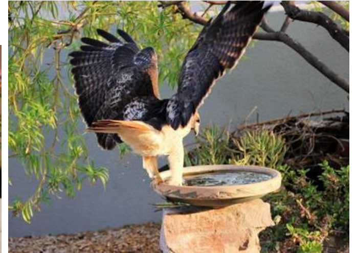
A Little Small, but perfect for cooling your heels!

What are you looking at?? What would YOU do if you had all these feathers??