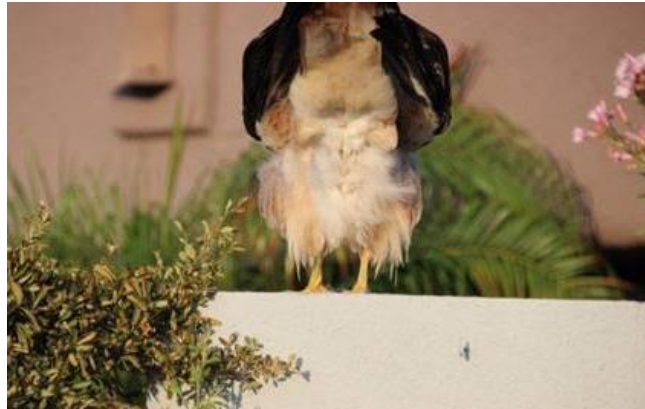
An Official and Rare Red Tail Moon Shot (!)