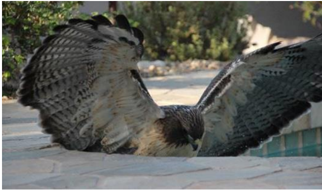
How about landing gently on the first step . . . .