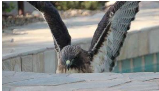
Perfect, just as I thought!!