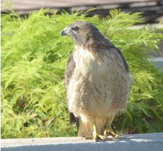
You know what, the sun feels great, but I wouldn't mind one more dip.