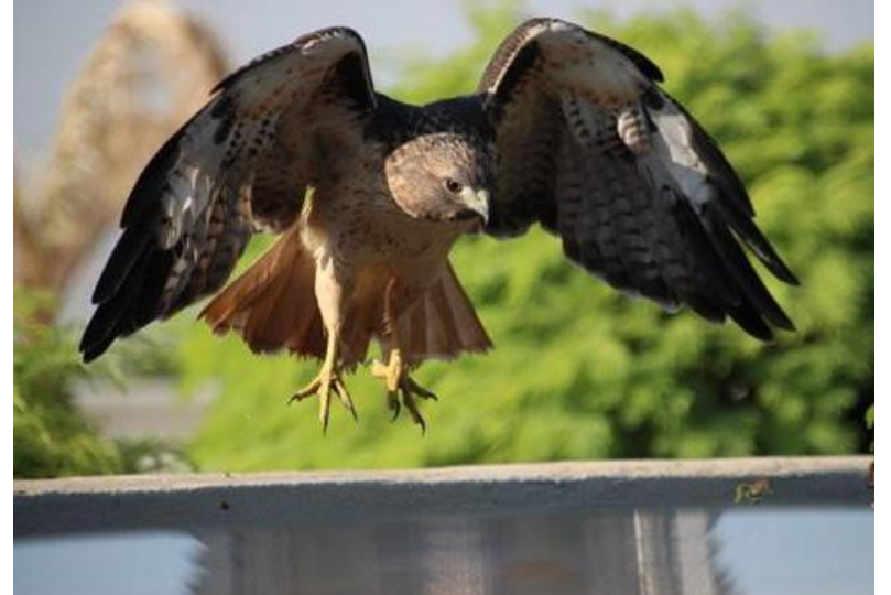
Let's see, how did I do that again???