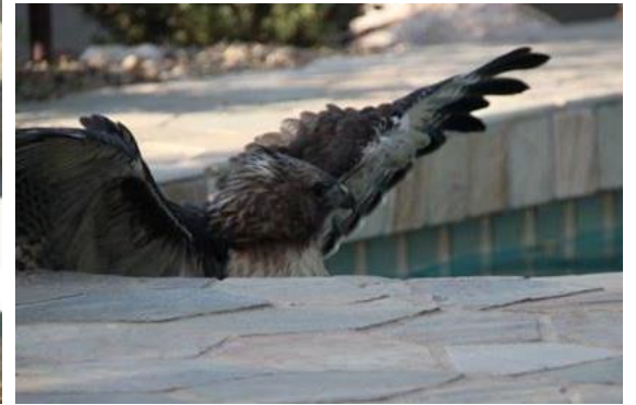
...Ahh Yes, Plop and Flop!